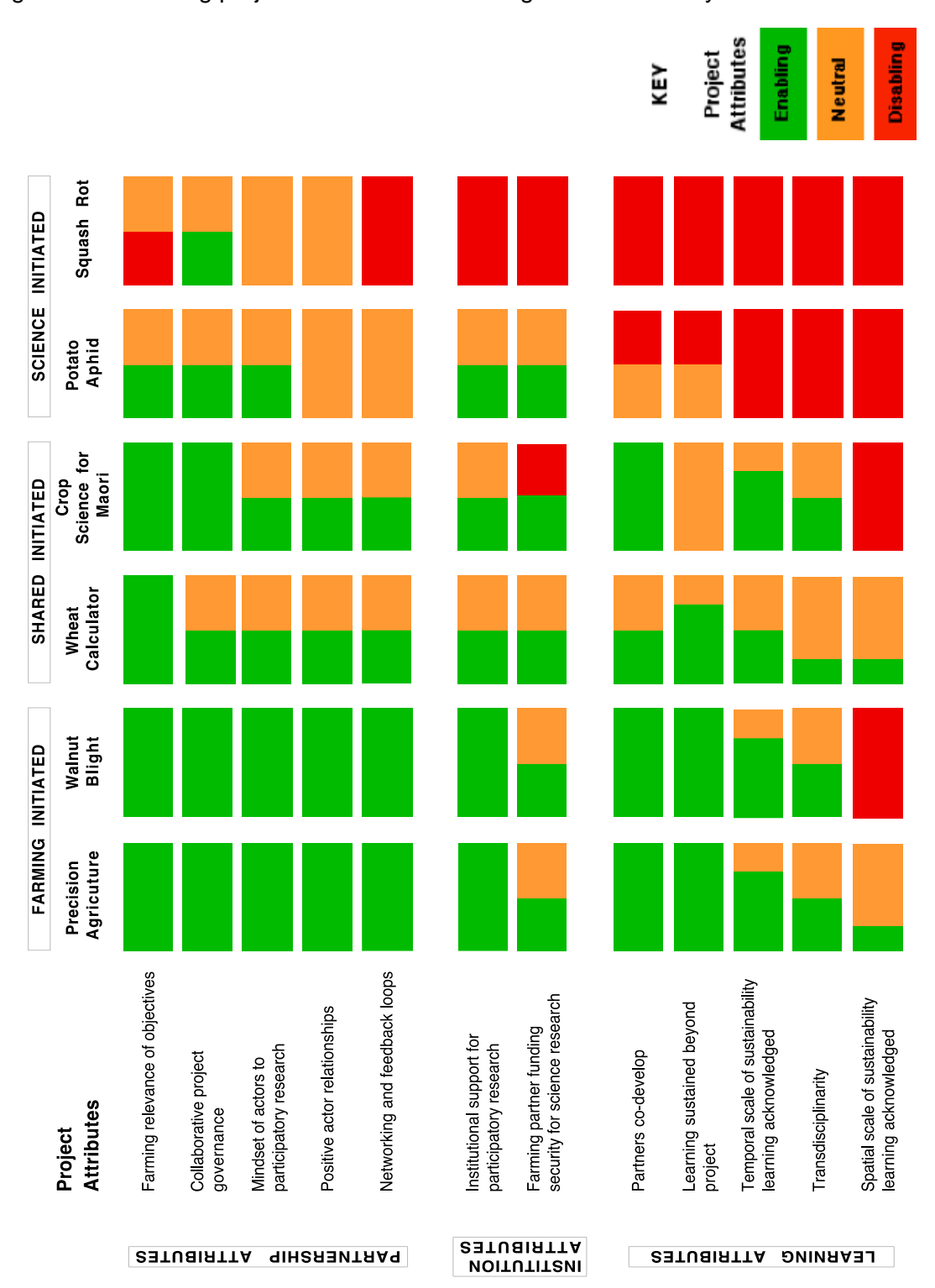
Figure 2: Visualising project realisation of learning for sustainability