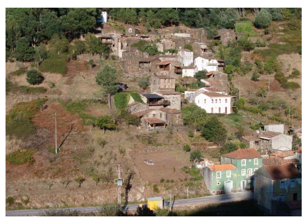
Figure 2. The village of Candal (Lousã Mountain, Central Portugal)