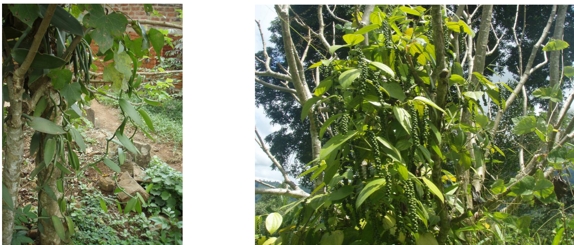
Figure 2. Jatropha as support plant for spices (vanilla and black pepper).

land 7 . The decline of banana yields on the other hand can be observed through the growing number of pineapple plants on this stands, although, due to low market development, prices and production risk are less attractive for the farmers. Observed but within the survey to be proven is the change of production measures like the increase of contouring or planting of trees which certify a rising awareness of the depletion of soil fertility. At the same time does the difficult market access and a hardly cost efficient production (periodically occurrence of high yields and no drain off to market lead to negligible prices) encourage farmers to seek new production opportunities. This is one of the reasons why the production of spices such as black pepper, cardamom, cinnamon and vanilla within the farming system of Tandai is increasing (see figure 2). This is also the reason for the appearance of the shrub Jatropha as host plant, since the normally (but increasingly formerly) used trees caused unacceptable harvesting casualties. Generally was the harvesting process characterised by being much more complicated. Today a lot of Jatropha trees – up to 4.5 meters – can be seen in Tandai, but with currently unused seeds. Therefore it can be inferred that a potential for outgrower schemes with Jatropha exist.