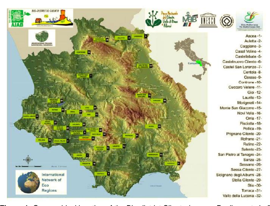
Figure 1. Geographical location of the Bio-district Cilento

In this land, farmers, citizens and public administrations made a pact for the sustainable management of local resources and this characterize the Bio-district as a social innovation in governance. Initial activities focused on creating a network of organic farms, producers association, municipalities, caterers, eco-tourism operators and consumers through short supply chain initiatives. In few years, the Bio-district has attracted a large number of local actors, and the activities went from the exclusive creation of a market for organic product to the preservation of local traditions and to the support to rural development.